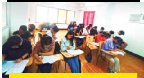
Weekly Mock test & Doubt Solving Session