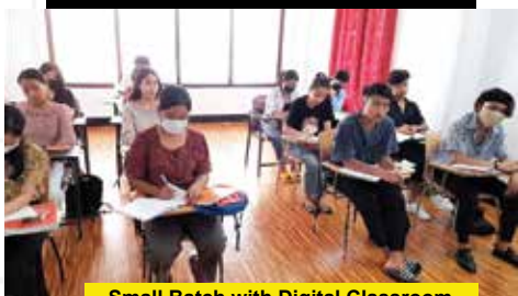
Small Batch with Digital Classroom & A.C.

Vision Institute, Dimapur was commenced with an aim to impart high quality education to students preparing particularly for NEET. The team of VISION INSTITUTE started modestly with a goal to provide an impeccable launchpad for sincere medical aspirants. Today VISION stands apart and well above the rest as an epitome of success. We at VISION endeavour to make our student adept and develop in their academic excellence and confidence to clear the exam in the first attempt.