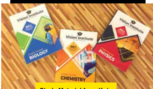
Study Material from Kota